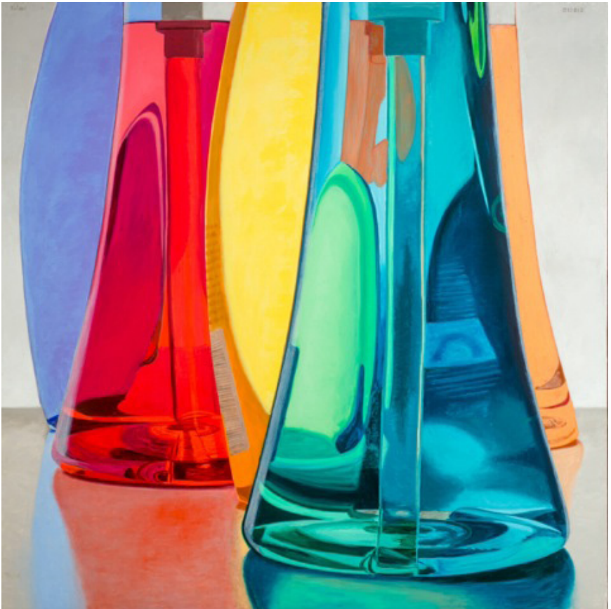
Dish Soap #22